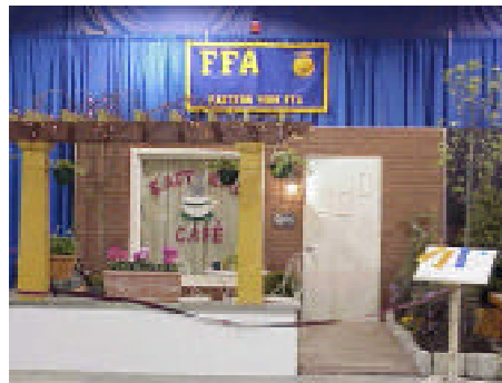
1st Place Landscape Exhibit

FFA members from Eastern York High School, York County, captured 1 st place in the FFA Landscape Exhibit competition at the Farm Show. The “East End Café”