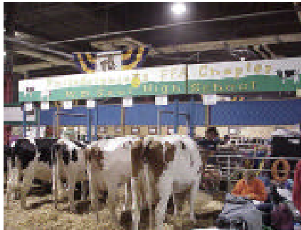
W.B. Saul FFA Members' Show Cattle housed at the Farm Show.

the 1970's and the Northeast Building in 1993. Also during this time, the Complex suffered through at least 3 major floods, numerous snowstorms, and an