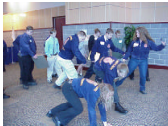
Students learning about team-building through a series of activities.

On the morning of October 11, 2002, the AEE 311 and 412 students of The Pennsylvania State University gathered at the Blair County Convention Center in Altoona, PA. The day was the culmination of over a month’s work for both classes, as they had been preparing for the annual Fall Conference for Leadership and Professional Development – FCLPD.