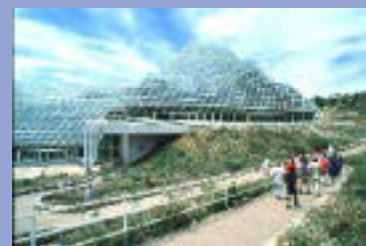
Like No Other Place On Earth Seminar Site "Columbia University's Biosphere II"

Tuscon, Arizona will host the second Science Alive conference from January 2-5, 2002. Conference topics will include mushroom growing, hydroponics and aquaponics, and biological control of insects. University of Arizona credit will be available to attendees. The early registration fee is $295 before Nov 1. The final registration deadline is Dec 1 and there are only 350 spaces. Information is available at http://ag.arizona.edu/science_alive or from Curt or Ann Bertelson at 520-408-6923 or sciencealive@ag.arizona.edu . The Doubletree Hotel is the conference hotel and the number is 520-81-4200.